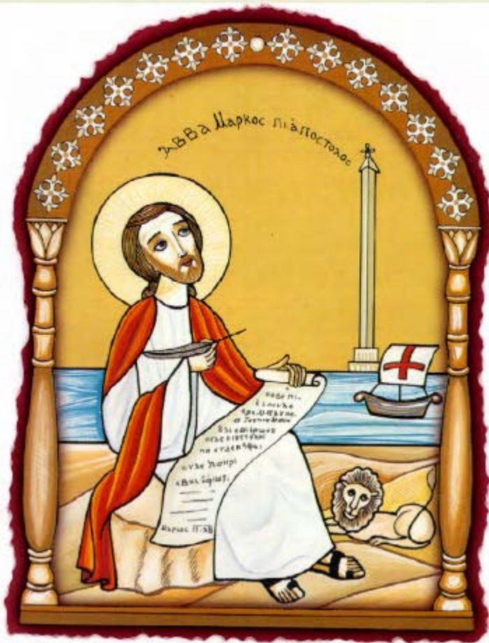
THE BEHOLDER OF GOD MARK THE EVANGELIST SAINT AND MARTYR